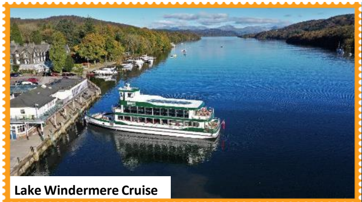
Lake Windermere Cruise

Today morning check out and embark on a visit to tranquil Lake District, considered the finest of England's National Park. Enjoy the Windermere Lake Cruise - the most popular attraction in Cumbria. Windermere is England's largest lake, in the heart of the Lake District. Later at Scottish Highlands experience how whisky is been made and the process of creating the finest Scottish Whisky. Next, continue to Glasgow city - famous for its contributions to architectural styles, with the Glasgow School of Art being the most notable example. Check-in to the hotel and relax.