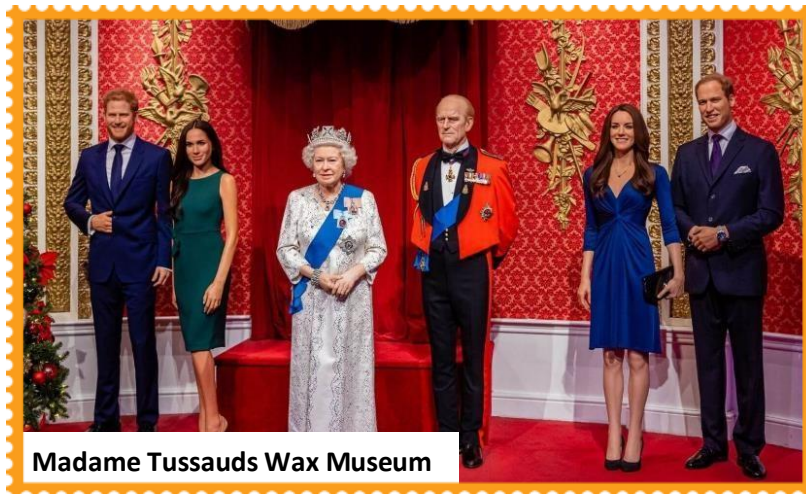
Madame Tussauds Wax Museum

Visit to the famous Madame Tussauds Wax Museum. Stratford-upon-Avon. Onto Manchester.