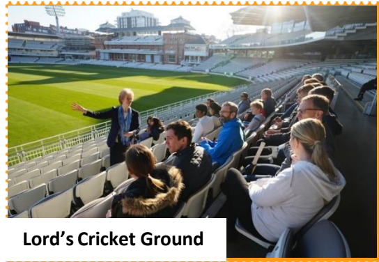
Lord's Cricket Ground

Post breakfast, we drive to explore the city of London with our expert local guide. You will see important landmarks like the Big Ben, Houses of Parliament, Westminster Abbey, Trafalgar Square, Piccadilly Circus, Tower Bridge, River Thames, Hyde Park and many more. Witness the Changing of the Guards at Buckingham Palace (subject to operation). Next, we proceed to visit one of the iconic cricketing venues in London – the Lord's Cricket Ground. In Lord's you will have an opportunity to go behind the scenes at the 'Home of Cricket', and to experience some of the most inspiring views in sport. See the iconic parts of the ground including the Grade II*-listed Victorian Pavilion, the world-famous Long Room, the Players' Dressing Rooms, and the MCC Museum, home of the Ashes Urn – cricket's best-known artefact. Complete your visit with a delightful lunch, soaking in the atmosphere of this storied ground—a must for any cricket enthusiast! Later we visit London eye, one of the many iconic highlights of the city. Enjoy scenic views of the city while you ride the London eye. It is one of the most popular tourist attractions in the United Kingdom, standing at 135 meters tall overlooking the river Thames and the beautiful city of London.